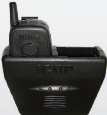
mic in base