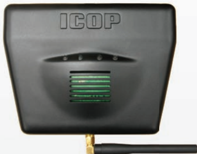
dual-mic charger / transceiver