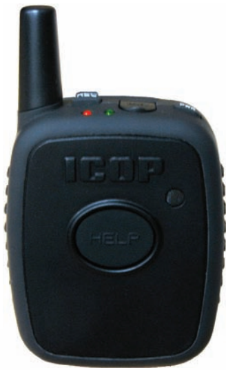
ICOP EXTREME™ Wireless Mic